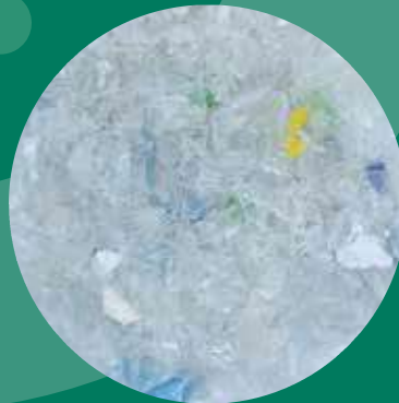
bottle flake sorting