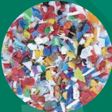
bottle cap sorting