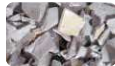
home appliances shells